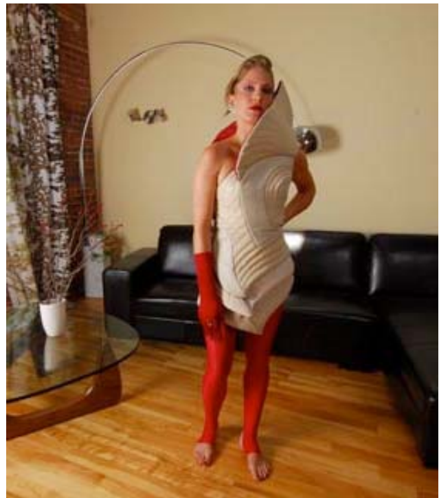
Fig 4 The “Skwrath” dress

SKWRATH is a quilted leather bodice, constructed out of stony leather lined with blood red silk. It integrates a sculptural wing-like collar around the head that can be used to conceal the face of the host and can be torn open to reveal the scarlet lining. The abdomen is made up of three interlocking leather segments or plates, embroidered with threads of shape memory alloy (SMA), which are activated through a custom electronic board to contract and curl back to reveal deep slashes of red silk.