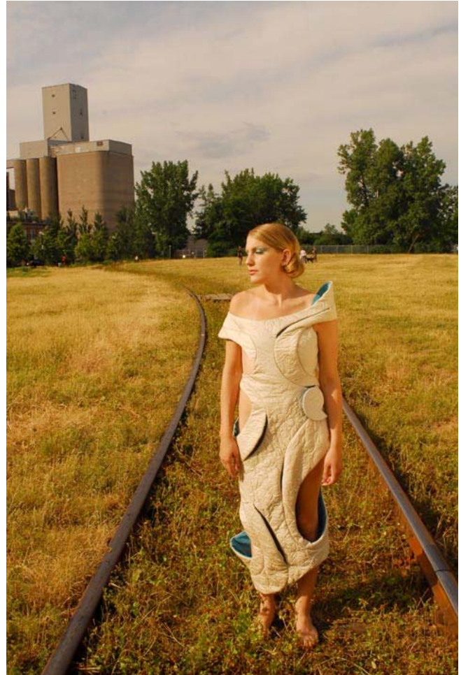
Fig 7 The "Luttergill" dress

shape memory alloy (SMA) stitched into the inside of the fissures. The SMA is controlled through our custom electronics board. LUTTERGILL twists and narrows around the waist, morphing into a belt that encircles the body and is fastened in the front with a bespoke leather clasp. LUTTERGILL is accessorized with a beautiful asymmetric skullcap that shields half of the face and curls around to accentuate the exposed eye.