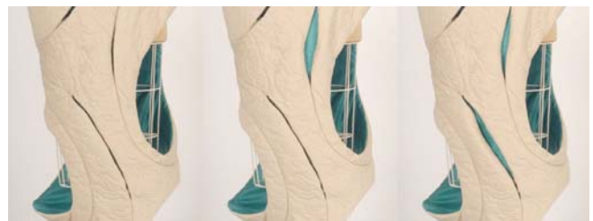
Fig 8 The animation of the "Luttergill" dress

Acknowledgements Skorpions is funded by The Canada Council for the Arts, the Hexagram Institute for Research/Creation in Media Arts and Technologies, and the Social Sciences and Humanities Research Council of Canada.