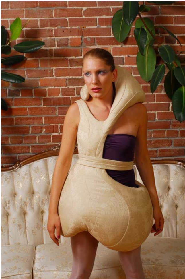
Fig 6 The "Slofa" dress

SLOFA is the bastard child of a snail and an elegant upholstered divan. It is sculpted out of heavy upholstery foam, covered with a rich ivory-colored brocade and lined internally with dusty purple silk. The contours of the pattern swirl around the shell to intersect its form. Its padded shoulder piece provides a resting place for a tired neck. It is a wearable piece of furniture that slows down the host and promotes laziness. SLOFA has a slithery internal petticoat and pearly dongles that move in and out of the shell. Shape memory alloy (SMA) coils allow the dongles to rise and fall, giving the appearance of jeweled tentacles that creep out to experience the world and retreat back when they're satiated or afraid.