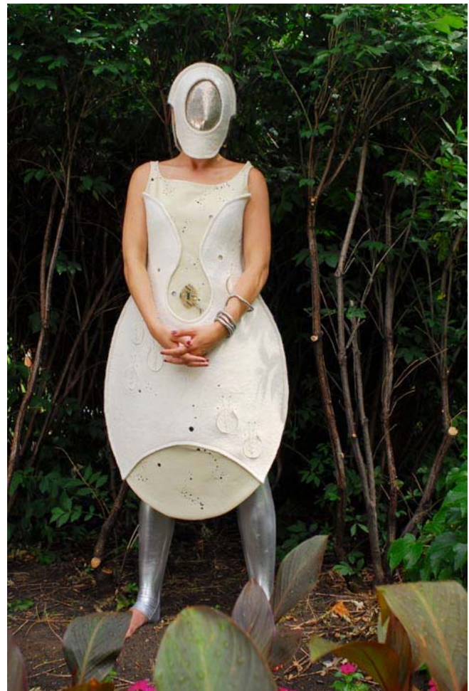
Fig 1 The “Enleon” dress

Skorpions reference the history of garments as instruments of pain and desire. They hurt you and distort your body the same way as corsets and foot binding. They emphasize our lack of control over our garments and our digital technologies. Our clothes shift and change in ways that we do not anticipate. Our electronics malfunction and become obsolete.