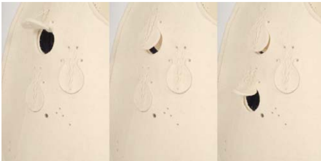
Fig 2 The animation of the “Enleon” dress

ENELEON is constructed out of heavy hand-made felt, creamy leather, and reflective lamé lining. It is shaped like a large bilateral symmetric pod that encloses the body from front and back. The materials are perforated with small decorative holes that allow some airflow around the body. Each side features six scattered scales that rise and lower in order to reveal a mirrored lining. The movement is activated by beaded shape memory alloy (SMA) coils, controlled through custom electronics. A sculpted felt mask obscures the face with reflective chain mail, further erasing the host’s identity. The front and the back are identical, so the host assumes an element of radial as well as bilateral symmetry.