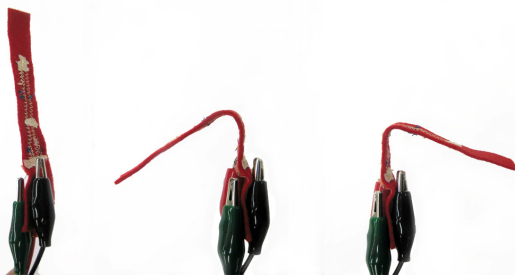
Figure 3. Two-way actuation

For our first prototype, we developed a Teflon and SMA spun yarn in which the SMA is actuated to curl the fur strand down, while the yarn's internal structure forces the strand back up to its original shape. In spite of being electrically insulated and fire retardant, the Teflon yarn is affected by increasing hysteresis and over time it starts to 'learn' and retain the shape of the SMA, losing strength to counteract the actuation force of the alloy. In an attempt to address this problem, we also experimented with different knitting techniques and a composite consisting of SMA, Teflon-wool yarn and polyurethane. The polyurethane in this case was chosen because of its tensile strength and capacity to return to its original shape after deformation. However, this technique proved to be impractical, since the balance between the materials' strength was hard to control and could not account for variations in fabrication and use.