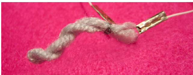
Figure 2. Teflon and SMA spun yarn

Our primary design goal was to create a soft interface that could sense, mediate and communicate touch in a subtle and non-intrusive manner, taking advantage of textural and surface changes, rather than light emitting techniques. To develop a material that could preserve its soft properties, while being continuously actuated, we experimented with several SMA and textile techniques.