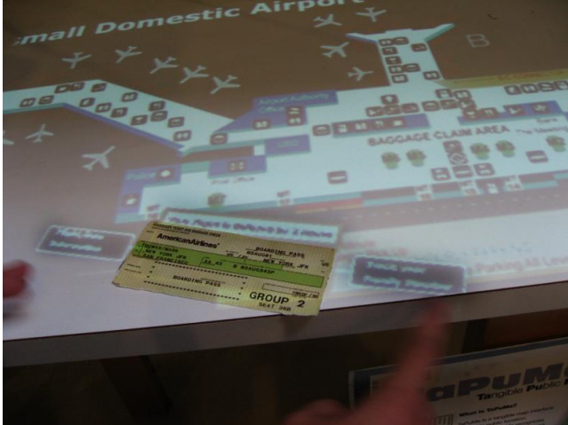
Figure 3. Working prototype of TaPuMa.

everyday objects for the prototype: a passport, a one-dollar bill, a cigarette box, a medicine case, a cup and a boarding pass. We embedded the tokens into each object so that Sensetable can detect the position of each object. The flash program generates graphics for the corresponding objects on the airport map, for example, in figure 3 TaPuMa shows the position and path to the gate when the boarding pass is placed on the surface of TaPuMa. Since Sensetable can detect multiple objects on the map, this prototype can be used by multiple people at the same time.