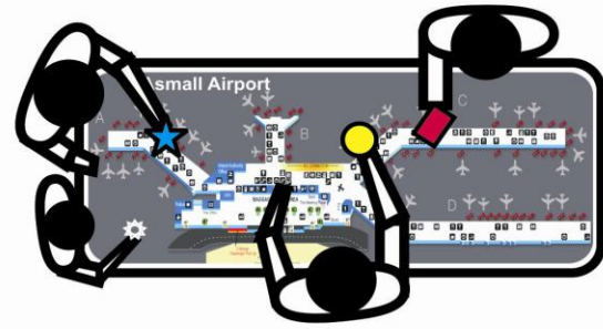
Figure 1. Multiple users interacting with TaPuMa using real-life objects.

TaPuMa is a digital, tangible public map that allows people to use their own belongings or the everyday objects they carry with them